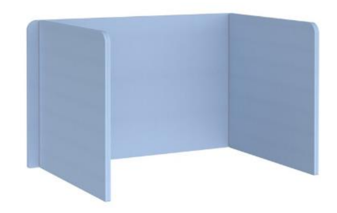
Fabric 3-sided high screens From £286.95

Direct delivery from the supplier, up to 8 weeks currently.